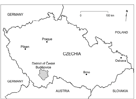
Fig. 2. Location of the study area – the District of České Budějovice

the suburban hinterland (zone) around the city of České Budějovice (Fig. 3). Several suburbs,